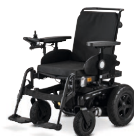
iCHAIR MC BASIC