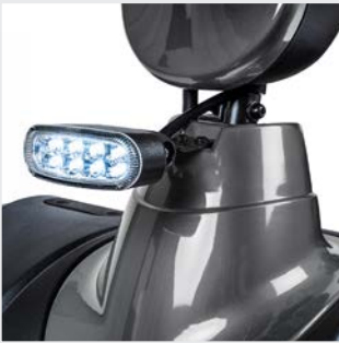
State-of-the-art LED technology