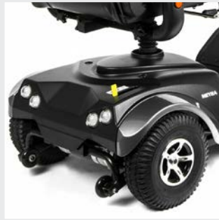
1,600 Watt motor