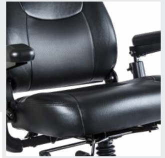
Spring-loaded comfort seating system