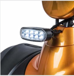
State-of-the-art LED technology