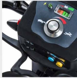
Simple user guidance