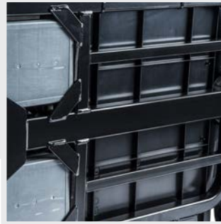
Extremely robust cassette-type frame