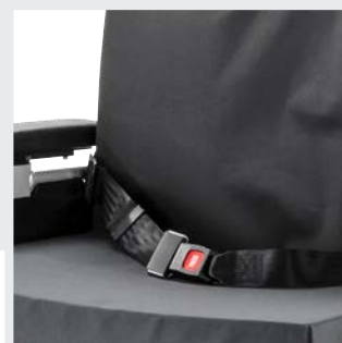
Reinforced seat belt