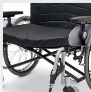
Increased stability with the use of a twin scissor mechanism