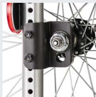
Wheelbase extension by turning the varioblock backwards