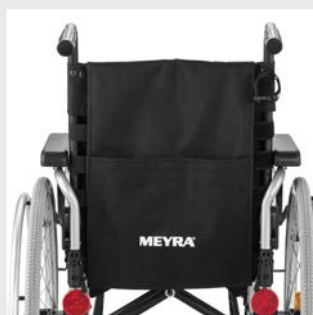
Adjustable back standard