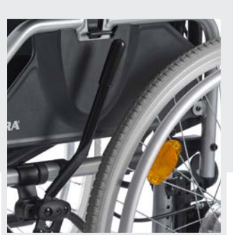
Brake lever extension