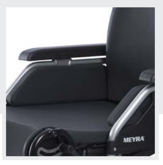
Ergonomically shaped seat cushion