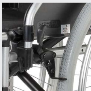
Knee lever brake