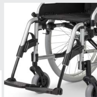
Legrests swing-away inwards and outwards