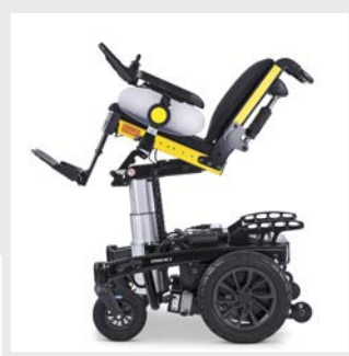
200 mm seat lift, tilt