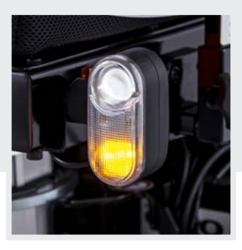
Long-life LED lighting