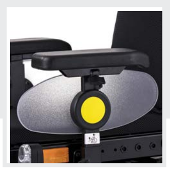
Side panel transparent