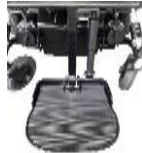
81017 Footplate flip-up electric